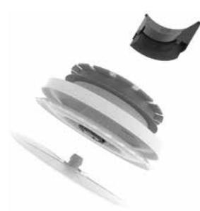
ComfoValve Luna S125, exploded-view drawing