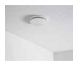
ComfoValve Luna S125, ceiling installation